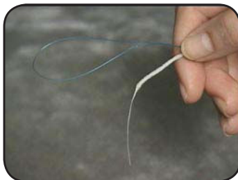
Superfloss showing stiff and fuzzy, tufted segments

Brush and floss your teeth and gums normally after each meal to keep your mouth healthy. Make sure to brush and floss the abutment teeth carefully to keep them strong and healthy.