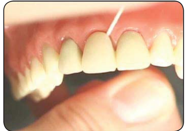
Superflossing a bridge